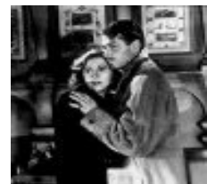
A scene from the 'Alfred Hitchcock' 1940 Movie of "Rebecca"

Set in the 1930's in Manderlay, Maxim de Winter's country house in Cornwall. A romantic and intriguing story of Maxim's second wife as she slowly pieces together her husband's tragic and unhappy past when married to the beautiful, but willfully treacherous Rebecca. It is as moving and exciting as the book upon which it is based & Daphne du Maurier's strongly drawn characters, including the obsessed, malicious housekeeper Mrs. Danvers are still as powerful, engaging and true as when it was first written. It is a truly epic Gothic Romance.